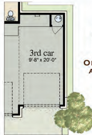
OPTIONAL 3RD CAR GARAGE