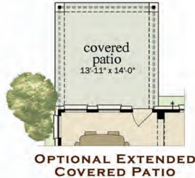
OPTIONAL EXTENDED COVERED PATIO