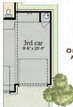
OPTIONAL 3RD CAR GARAGE