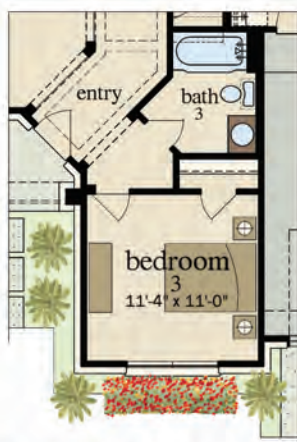
OPTIONAL BEDROOM 5