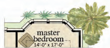
OPTIONAL BAY WINDOW AT MASTER BEDROOM