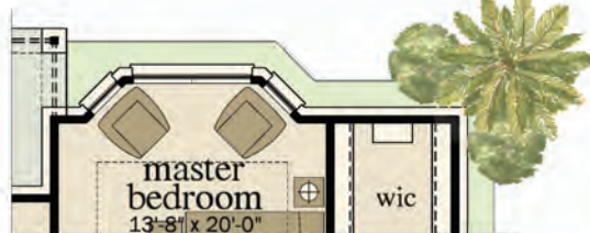
OPTIONAL BAY WINDOW AT MASTER BEDROOM