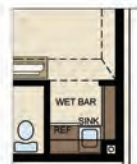
OPTIONAL WET BAR