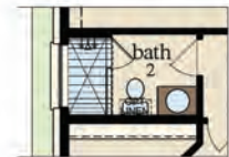
OPTIONAL BATH 2