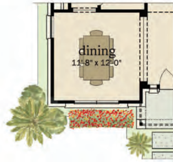
OPTIONAL DINING ILO STUDY