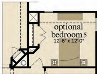
OPTIONAL BEDROOM 5