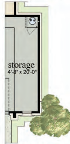
OPTIONAL 5' STORAGE