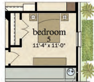
OPTIONAL BEDROOM 5 I/O STUDY