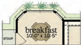
OPTIONAL BAY WINDOW AT BREAKFAST